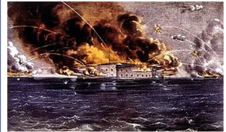
Bombardment of Fort Sumter Charleston Harbor 12th & 13th of April, 1861 By Currier & Ives

Andrew Carnegie Free Library & Music Hall Carnegie, PA