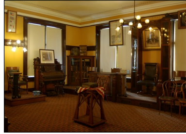
Capt. Thomas Espy Post No. 153 Grand Army of the Republic

In addition to housing a fine community library and acoustically superb music hall, the “Carnegie Carnegie” is home to a true national treasure — the Capt. Thomas Espy Post No. 153 of the Grand Army of the Republic. The Post has been documented as perhaps the most intact GAR Post in the country. At one time there were close to 7,000 posts from Portland, Maine to Portland, Oregon. The Espy Post was meticulously restored in 2010 to its turn of the last century condition.